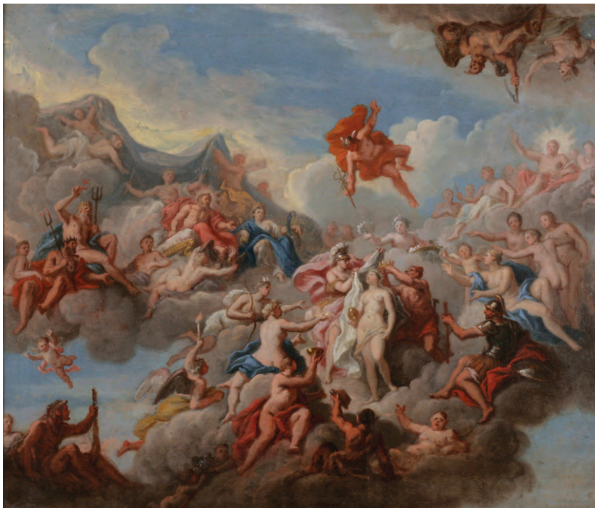
15. Pandora receiving gifts from the gods, by Louis Laguerre. c.1719. Canvas, 54.6 by 64.8 cm. (Victoria and Albert Museum, London).

Fig.18). 12 This shows Pandora reclining, looking on as Epimetheus holds the jar and its lid, as figures emanate from it in a plume of smoke.