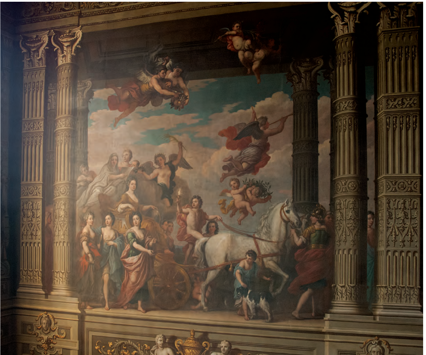
19. Elizabeth, Duchess of Somerset, riding in a triumphal carriage, by Louis Laguerre. c.1719. Oil on plaster. (Petworth House, West Sussex;).

that the house was entirely the Duchess of Marlborough's idea, and that she oversaw its construction and directed the commission of Laguerre's murals, while the Duke merely paid for it. 25 It is highly probable that the Duchess of Somerset would have seen the murals at Marlborough House, which covered the main entrance hall and the two staircases to either side of it, and was inspired to communicate her own message through the same medium. That it was she who was responsible for supervising the Petworth commission, and consulting with Laguerre over its content and composition, is far more likely than its having been the work of the Duke. But such themes, though carefully veiled for many years within the guise of a traditionally misogynistic myth – Pandora – and stories of male virility – Prometheus – are, on inspection, very much in play. 26 With the identification of the Victoria and Albert Museum's sketch and the consequent revelation of the evolution of the commission, new light can be shed on the iconographic impetus behind the Petworth staircase, as well as prompting us to question traditional assumptions regarding the patronage of murals.