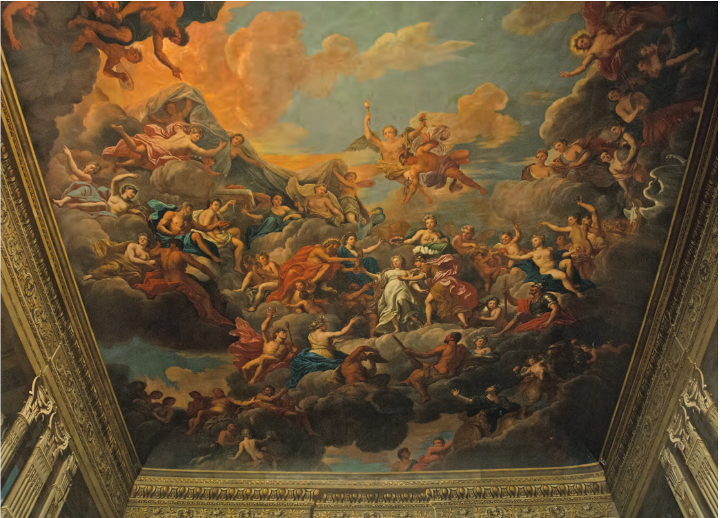
16. Pandora receiving gifts from the gods , by Louis Laguerre. c.1719. Oil on plaster. (Petworth House, West Sussex).

columns to the right. In the allegorical scenes celebrating the Arts, including architecture and music, over the balcony on the west wall, it is female figures who meet the spectator's gaze. Below the upper flight of stairs, a woman with a child sits on a fictive ledge, her hand resting upon it and her head turned to look at the torch race in the painted view beyond. Even the unusual, richly decorated painted architecture on the first floor contains female herms on its pilasters.