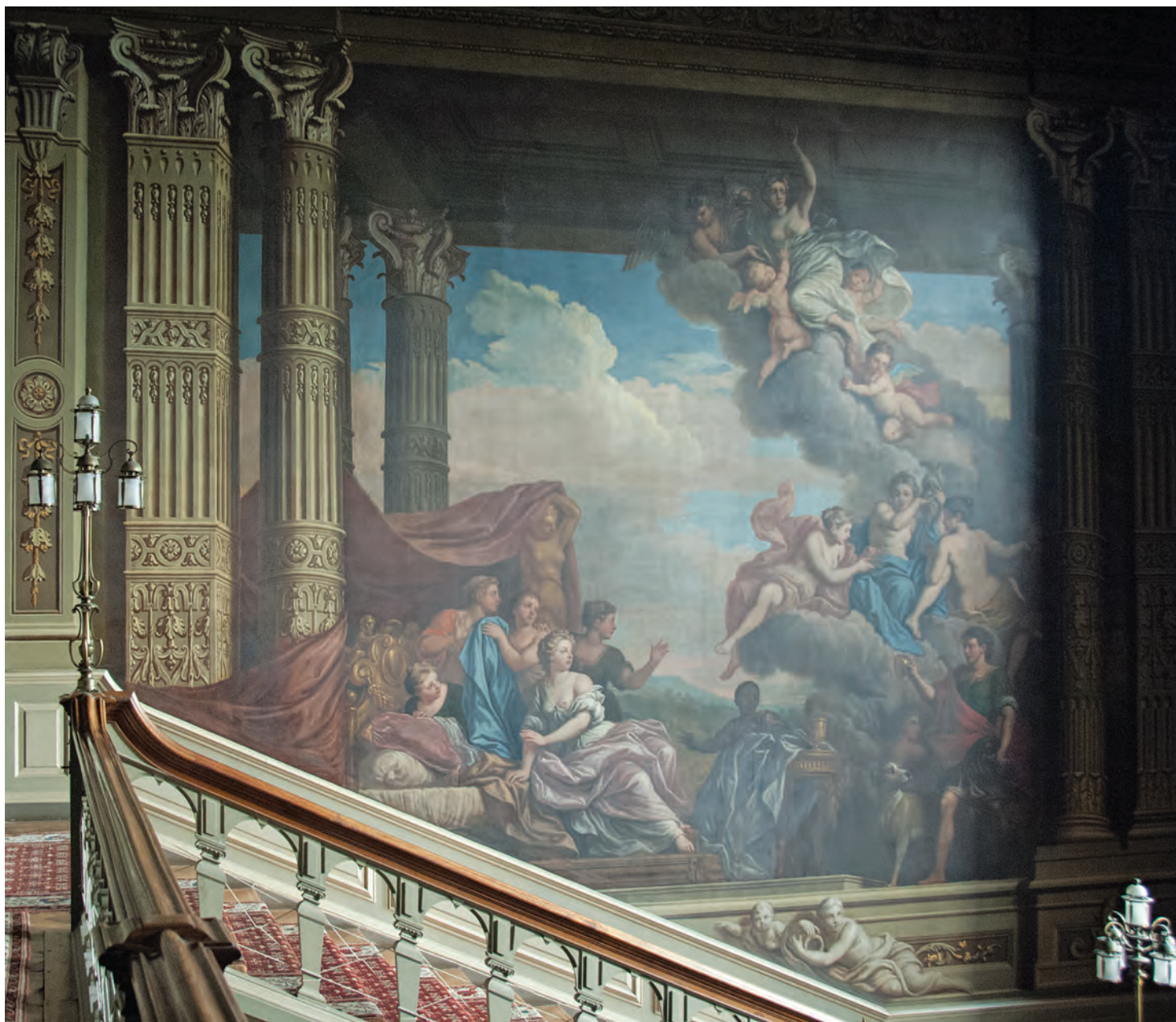
17. Pandora and Epimetheus , by Louis Laguerre. c.1719. Oil on plaster. (Petworth House, West Sussex).

the unusual repackaging of the Pandora myth that offers an opportunity to convey female virtue in its rebuilding. Besides drawing parallels between Pandora and the Duchess through their juxtaposition on the main walls and through shared visual devices such as the torch, there are also physical similarities between the two women: Pandora has the same strawberry blonde hair for which the Duchess was famous, and which can be seen in her full-length portrait by John Closterman (Fig. 14). 22 A more tenuous, yet intriguing, connection between the two women is found in the covered jar that is Pandora's attribute. Christopher Rowell has remarked that the Duchess was an 'avid China collector', some of